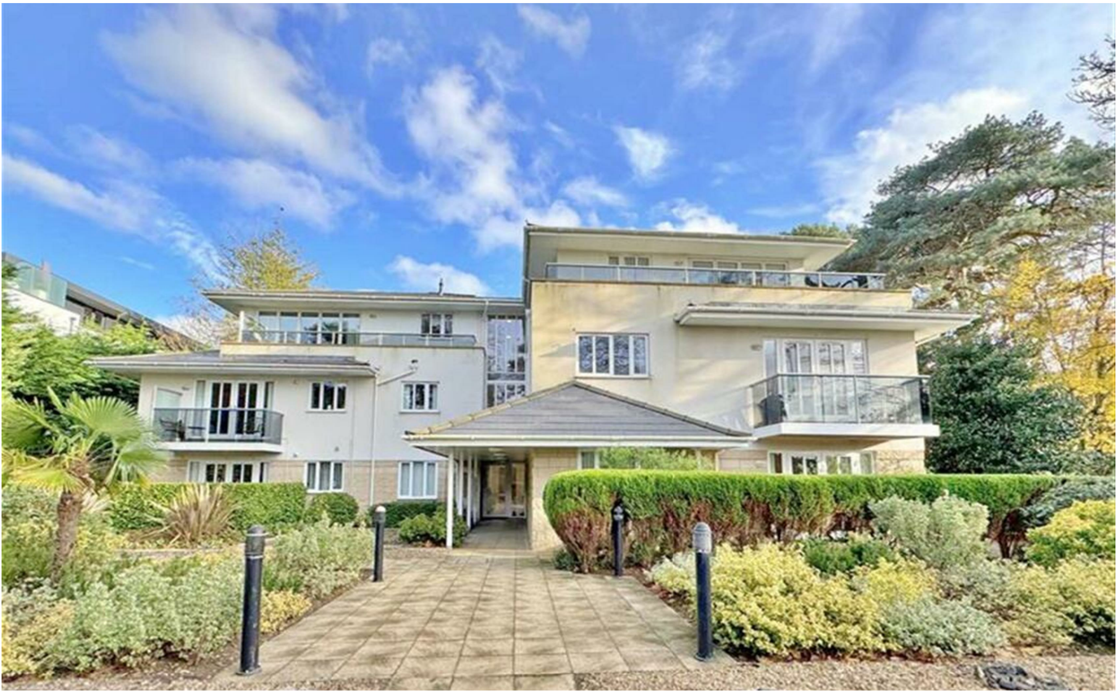
Flat 3 Peninsular Heights Bessborough Road, Poole BH13 7JS £425,000 Share of Freehold